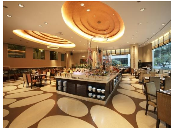
TONKA BEAN CAFÉ

A modern and spacious room at 36sqm for your comfort. Enjoy your buffet breakfast at Tonka Bean Café with Malaysian and International cuisine.